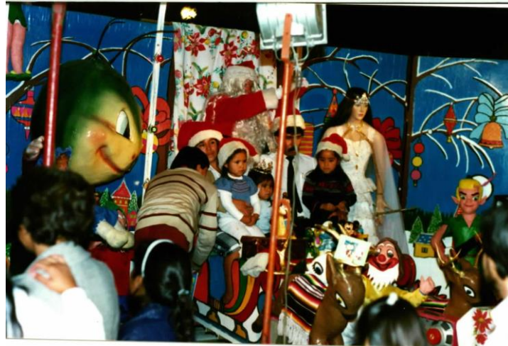
Christmas celebration in Mexico City

Upon walking through the lovely streets of this magic city I always stuck to my inherent inclination of denying my idiomatic background, i.e. my primary goal being abroad was to learn and to speak the respective language and dive into the cultural roots of the country.