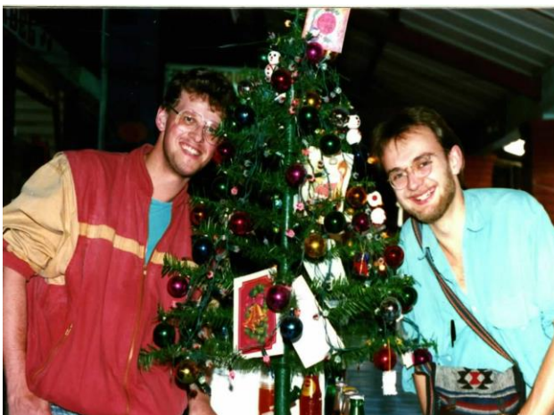
Two nice guys enjoying simplicity of life

The place was called Teatro Alcala Macedonia where we'd been nicely surprised by a choir consisting of boys and girls who had been dressed like 'Little Buddhas' in their orange-brownish robes and costumes. Eventually, the whole theatre was involved in their activities via parading through the audience and inspiring the people to sing and dance. A few extras suddenly emerged from backstage, too, waving huge flag-banners and joining the performance, which ended up in a sea of colors making everybody feel rather jubilant.