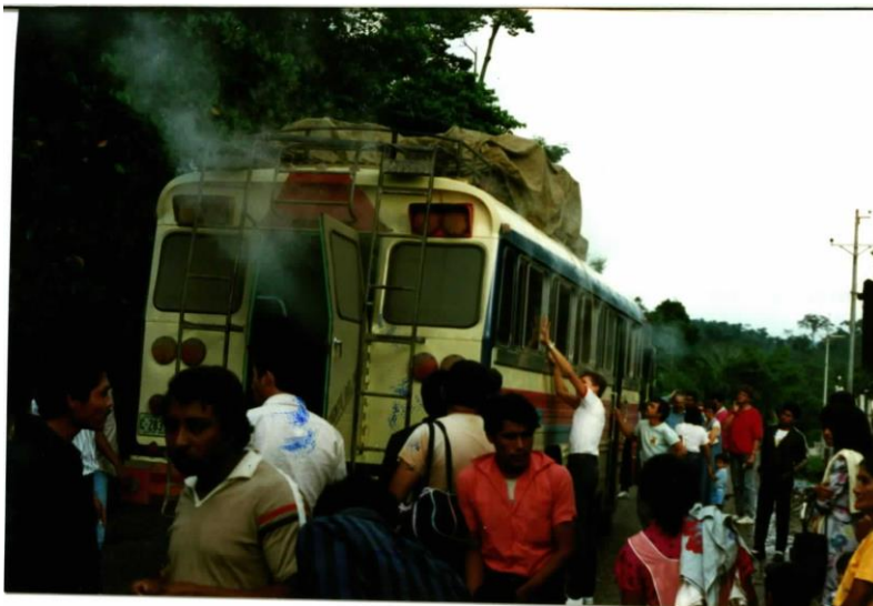
The bug fight in the jungle – the good looking chap in the back with the red sweater that's me

Upon approaching the entrance of the Tikal jungle our bus had suddenly been prevented from continuing. What happened? Everyone was asked to get off the bus and then sort of 'ghost busters' appeared to clean up everything inside. Obviously the bus needed to be examined for certain insects or scarce but dangerous bugs; since nobody really solved the overall confusion this explanation tends to be the only theory so far.