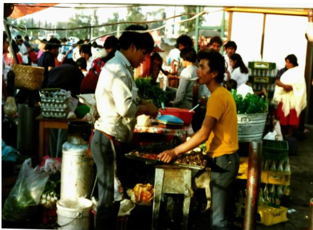
La vida real con mucha gente que está vendiendo una mezcla de comida

Friday the 25 th of December was the ultimate day of our departure from the unhealthy city. We confidently reached the TAPO, the central orient bus station and looked forward to diving into the rural beauty of Oaxaca very soon. Upon embarking the local bus we could not help grabbing a bite from the vendors surrounding the area. This time we went for una taza de fresa as a refresher for the upcoming horror trip as being clearly anticipated.