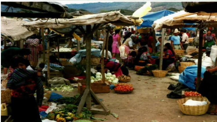
Market scenario in Oaxaca

Glad about the relief of pain we arrived in Oaxaca early in the morning being completely shattered and longing for some rest. The sun was rising and we were just in time to dive into the opening ceremony of the local mercado which was described as the biggest and most famous one in Middle America. Once we succeeded in cherishing some relaxation and rejuvenation we planned to explore the market life the next day. The fact that this splendid market only took place once a year made this occasion even more spectacular. Predominantly old and young natives were busy fixing their warehouse-like stalls to sell turkeys, chickens, all sorts of different decoration material for Xmas, clothes and cloths and many other striking thingamabobs.