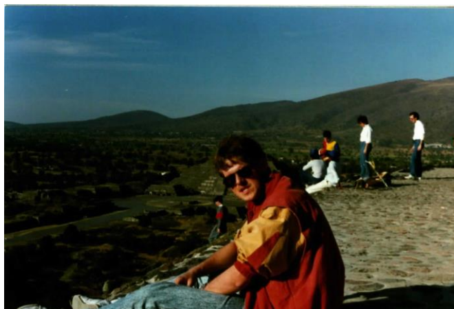
La pyramide del sol con migo

On top of it we were rewarded with a gigantic view over the plateau. Once we reached the peak – not underestimating the steepness of the stony stairs – I simply felt great like the king of the world (do you recall the respective scene in the movie Titanic ?), who proudly adored la pyramide de la luna , that was to be found at the opposite side of the alley. Now it seemed to be the right moment to ponder and contemplate about the historical roots of the Azteks and their way of life in former times.