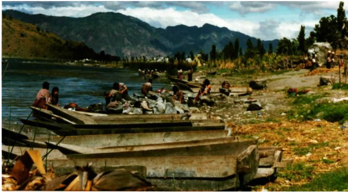
The peaceful area around the volcanos near Lago Atitlán.

All of a sudden my feet recognized sort of muddy ground which was not exactly differentiable from the surrounding. Since we were a bit in a hurry I just ignored that aspect unconsciously but could not avoid being slowly drowned in the mud. At first glance I had no idea whatsoever how to (re) act upon this rather unexpected occasion especially because my feet even more disappeared.