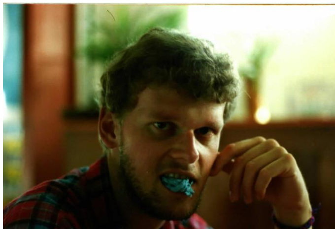
El desesperado – no comment

witty thought tackled our mind sooner or later. Probably in the jungle far away from civilization, anything can happen to anyone at anytime. We desperately tried to find a different airline with a cheaper price, but obviously there had been a general sobreprecio in this area. Now chaos and uncertainty predominated our last hours there. I felt so bad and sick that I nearly swallowed a piece of toilet paper.